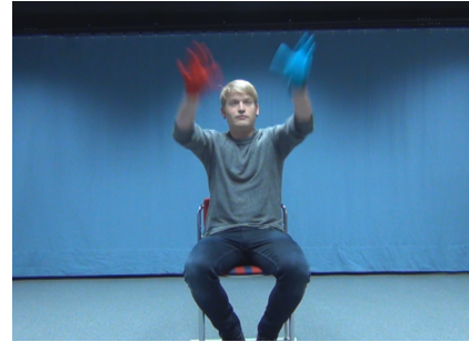
Figure 1: A participant expressing the verb 'bursting' viewed from the main camera.

The experimental tasks were recorded with two video cameras and a sound recorder. The main camera in front of a participant (see Figure 1) used a high definition 1080p50 format (with a double frame rate and increased resolution for capturing motion) while the secondary camera covered an overall view of the setting from the side (Figure 2). A highly directional AKG CK98 microphone was used for sound recording. Participants wore gloves of a different colour on each hand, thus providing an option for tracing the hand trajectories separately in video motion analysis (see, e.g., Jensenius, 2012).