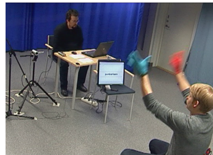
Figure 2: An overview of the experimental setting in a situation shown in Figure 1.